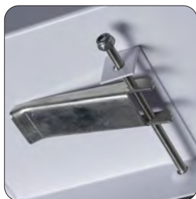
Easy Fix style bracket